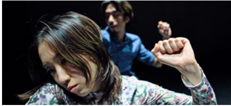
Stay with Me (!)