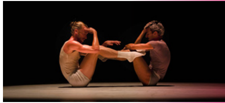
G.O.A.T.S (going on a trip, sis)