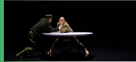
Are You Guilty?